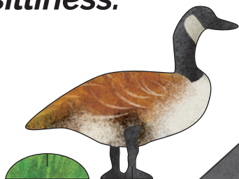
Pestering goose (looking for spent grain)

Take a break and enjoy a little mind-clearing, paper model silliness.